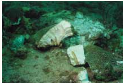
Shattered great star coral (Montastraea cavernosa), resulting from a vessel impact.